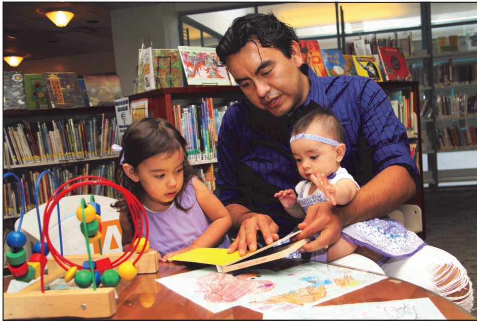
The Atlantic City Free Public Library's Summer Reading Program will include great books and programs for children of all ages and teenagers.

Call (609) 345-2269, ext. 3064, for more information.