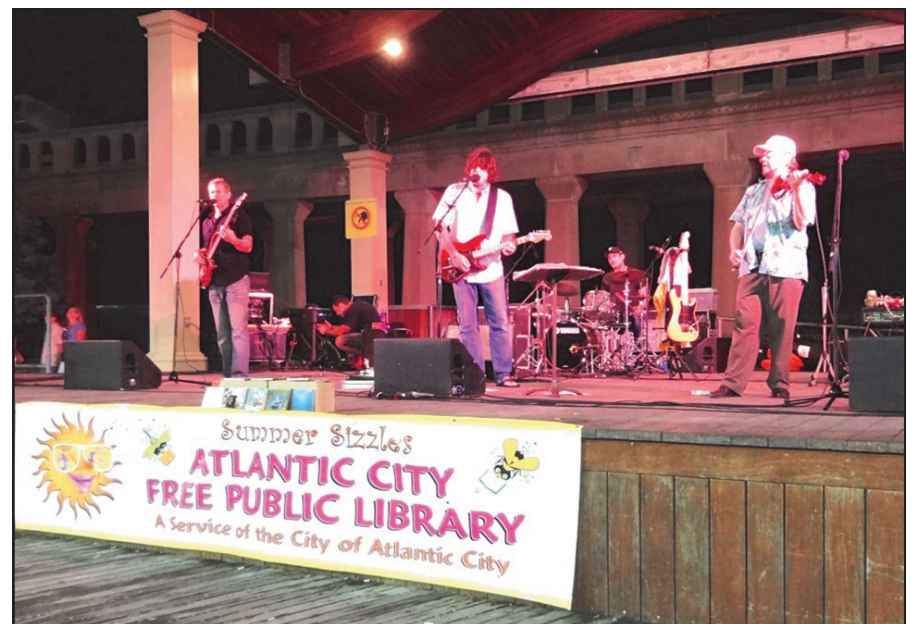
The Barley Boys, who play original, traditional and contemporary Irish music, are scheduled to perform at the Atlantic City Library International Night Series on Aug. 14. The group dazzled the crowd at last year's series.

Please check the July/August issue of Discovery or visit www.acfpl.org in coming weeks for the complete schedule.