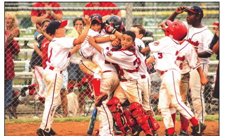
Photos that capture the spirit of American sports and showcase the athlete experience will be among those displayed. Examples of potential exhibit photos include these shots of the Grambling State University band performing during a football game and a Texas Little League team relishing a big win.